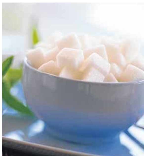
Sugar can help to include in the diet food that would otherwise not be consumed.

Different cross-studies conclude that there is a negative association between sugar intake and weight gain