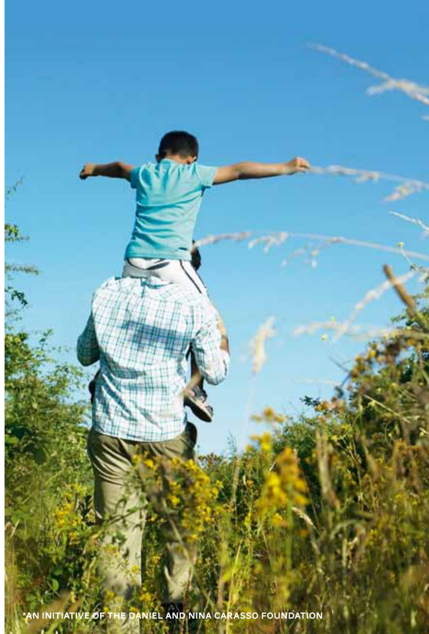
*AN INITIATIVE OF THE DANIEL AND NINA CARASSO FOUNDATION